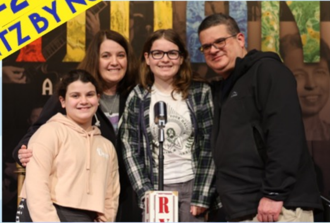
My Family of 4